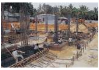
Excavation has begun for the foundations of 14-storey Magnolia and Cassia blocks.