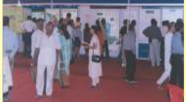
Visitors study the informative panels at the entrance