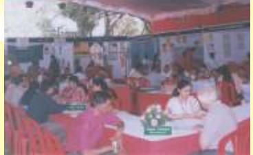
The Brigade marketing team at work

Visitors entering the imposing portals of Millennium Avenue were greeted by colourful banners and flags, which set a festive mood. Evidence of hectic construction activity and buildings in different stages of completion added extra excitement to an already upbeat scene.