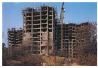
12 of the 14 floors of Mayflower Block have been constructed.

Construction is in different stages of progress at Mayflower, Magnolia and Cassia, three of the five residential blocks of Brigade Millennium.