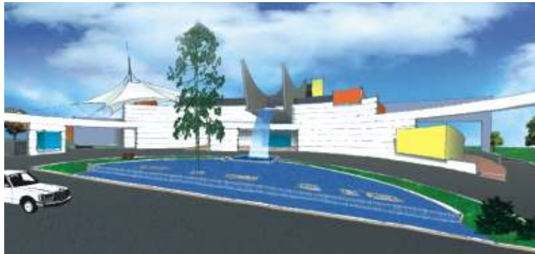
The Woodrose Club Millennium Avenue, Brigade Millennium