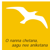
O nanna chetana, aagu nee aniketana BRIGADE-PSBB

"...to help shape the memory of innumerable future Brigade-PSBB students."