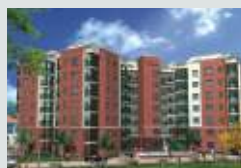
Brigade Mayfair Cambridge Rd