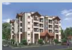
Brigade Heritage Cookson Rd