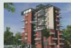
Brigade Coronet Palace Rd