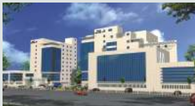
Brigade TechPark, Next to ITPL Up to 400,000 sft (37,200 sqm)

A great software facility at Whitefield !