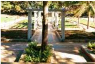
The Millennium Park

The three-acre Millennium Park is ready. The park will be an asset to the residents of Brigade Millennium with landscaped green spaces, an impressive floodlit amphitheatre / stadium, tennis and basketball courts, jogging track, children's play area, theme parks and the Japanese garden.