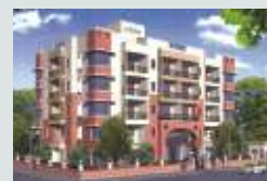
Brigade Hallmark Richards Town