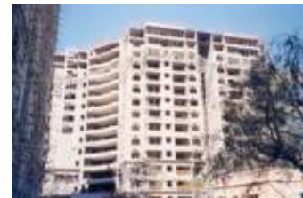
Structured completed - Blockwork of 14th floor underway