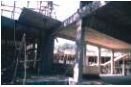
Internal civil work underway