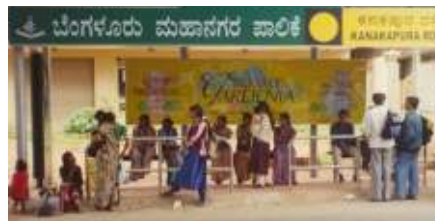
Brigade Gardenia bus shelter at Kanakapura Road

The neon signs on the bus shelters give them a fancy look. It brings alive the surroundings and makes waiting for a bus a little easier. In areas