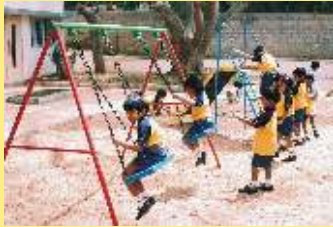
Students in the Brigade-PSBB School play area.

Welcome to Brigade Millennium in J.P. Nagar.