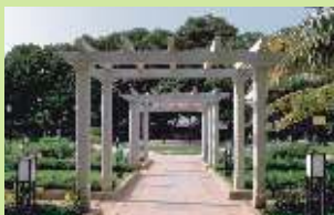
A section of Millennium Park