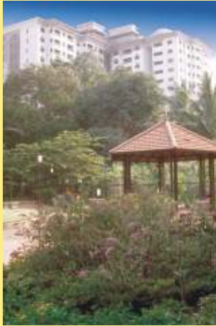
A view of Millennium Park with Magnolia Block in the background.