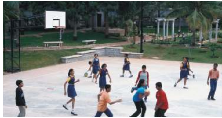
Students at play in the floodlit basketball court in Millennium Park