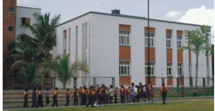
Brigade-PSBB School students return to classes after a sports lesson in the floodlit mini-stadium

established; more are to follow. Below are a few glimpses of school life at Brigade-PSBB School.