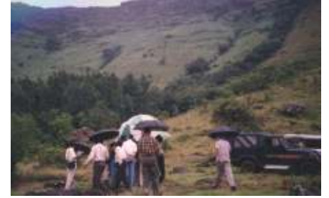
The short-listed architects studying the Brigade Hill Resort site during the visit in a mild refreshing drizzle

The architects have now sent in their designs for evaluation, which will be completed by September.