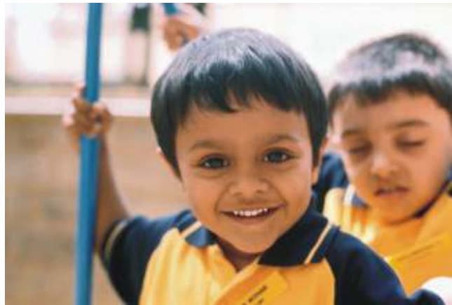
A Brigade-PSBB School student