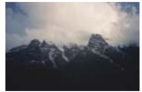
Sundown over Meru

Enjoy your way to the target. Or else the task becomes tougher!: (Harmony among your teammates is vital.) While we carefully