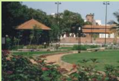
A view of the Bandstand at Millennium Park. The pavilion of the floodlit mini-stadium can be seen in the background