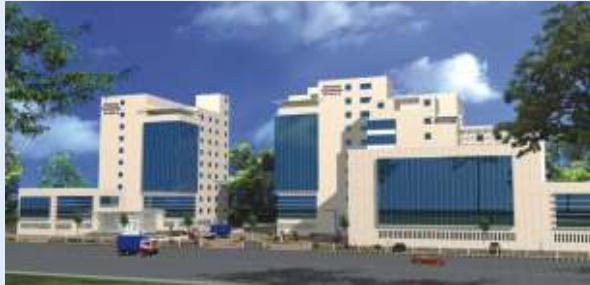
Brigade TechPark Whitefield (next to ITPL) (Under construction)