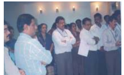
The Brigade team at the inauguration of the marketing team's new office

As the Brigade team is rapidly growing in size with many exciting new projects being planned, the need for additional space that would offer greater focus for the marketing team was being felt for a few months now. The interiors of our new office have been done by Praxis, who have also designed the Brigade-PSBB School.