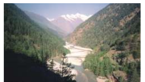
Bhageerathi river flowing in Chidwasa

You feel great when you reach the target and realise it was not that tough after all! When we reached Gaumukh, at about 11:30 a.m., it was a sense of achievement for the whole team. Some shot their 'V' signs into the sky, some wept and some of us stood stunned at the quietly flowing crystal-clear water. She was not the rough riding Bhageerathi but the