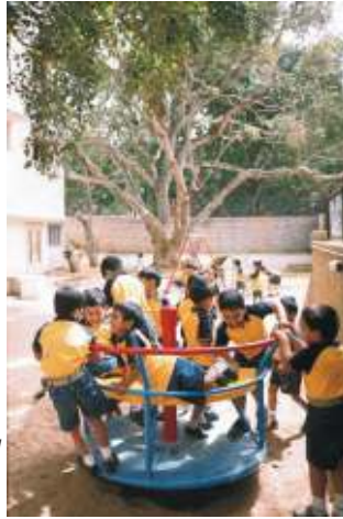
Students exercising in Millennium Park