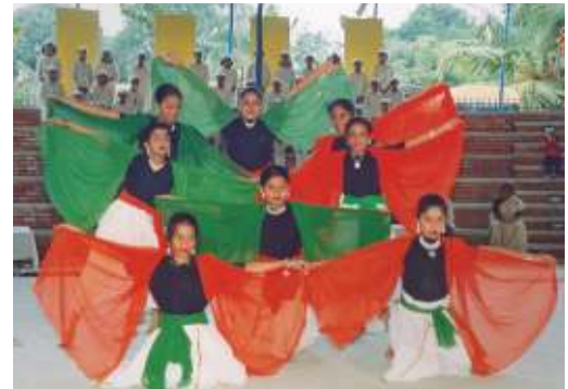
Students put up an impressive independence day performance