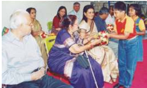
Students greeting the guests at the school day celebrations

The formal inauguration of Brigade-PSBB School was on 13 August, in a function that combined an Independence Day celebration with a first-time get-together of students, teachers, parents and all those instrumental in the setting up and functioning of the