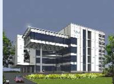
Brigade South Parade M.G. Road (Nearing completion)