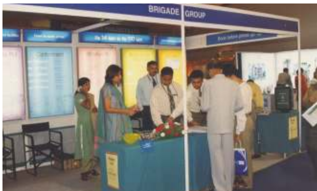
The Brigade stall at Realty, 27 and 28 March

Realty, the half-yearly property and home loans exhibition organised by Karnataka Ownership Apartments Promoters Association (KOAPA) was held at the Grand Ashok hotel on 27 and 28 March. The Brigade stall at the exhibition was much appreciated by visitors to the exhibition.