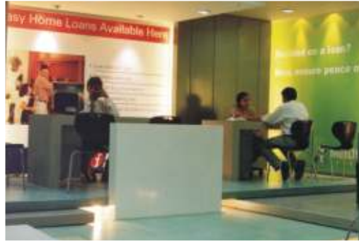
Tandem's one-stop customer service centre at Brigade Plaza

Tandem's Property Management Division takes care of facilities management, which