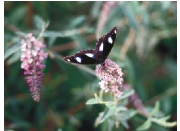
A butterfly—Danaid Eggfly (Hypolimnas misippus)—at home in Millennium Park. More about Brigade Millennium on page 4

Turn to Page 6 for more on Brigade-PSBB School