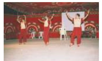
Group dance by some of the Brigade marketing team members

The venue shifted to the covered pavilion for cocktails and dinner. Rain Gods showed restraint, letting a very enjoyable evening end in a leisurely fashion: with conversation, jokes and even a little informal dancing over good food and drink.