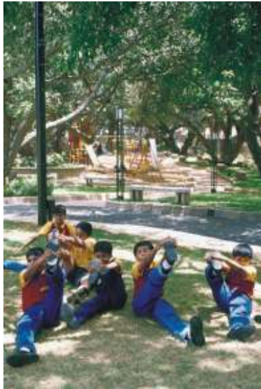
Students exercising in Millennium Park