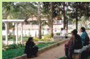
Evening chats and informal get-togethers at Millennium Park