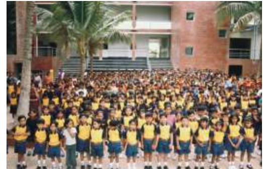
Brigade-PSBB School assembly in progress