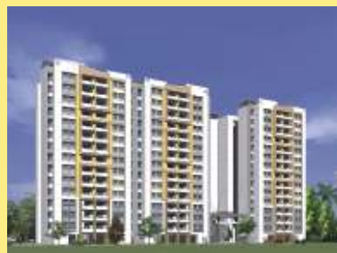
Artist's impression: Golden Magic Block