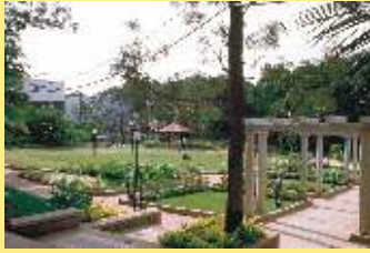
A section of the Millennium Park.