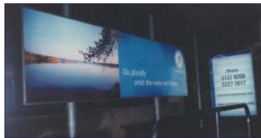
Brigade's bus shelter in Malleswaram

We have in the past tried to do our bit towards enhancing the city's aesthetics. The beautification and landscaping of the approach road to Bangalore Airport's departure terminal was just one such