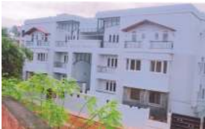
Brigade Tranquil, ready for occupation

Brigade Tranquil, our fifth luxury apartment project in Mysore, has been completed and is ready for occupation.