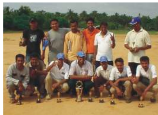
The Brigade team with the runners-up and individual trophies

The tournament, held at Loyola Grounds on Bannerghatta Road, was conducted by Venkataraman Associates, and sponsored by Anchor. The series saw some intense moments of cricket as well as much enthusiasm from members of the eight participating teams—and all their supporters.