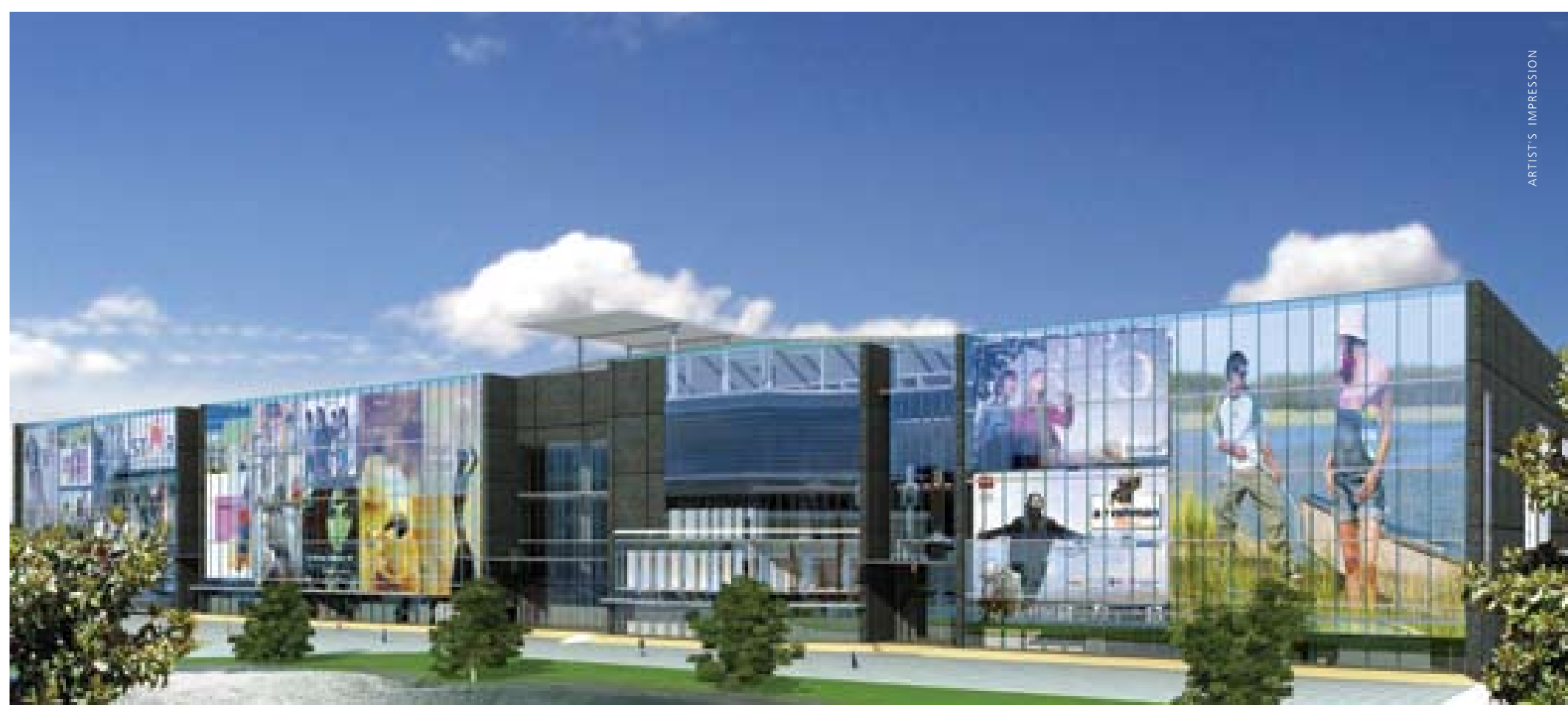
REAR VIEW OF ORION MALL, WITH THE PEDESTRIAN PLAZA AND MAN-MADE LAKE IN THE FOREGROUND

The mall is taking shape on several fronts. Construction is in rapid progress. Some of the main anchor stores have been finalised: Westside , Star India Bazaar and Landmark . The multiplex will be managed by PVR Cinemas . More anchor, mini-anchor and vanilla stores; restaurants, cafés, food courts and entertainment outlets are being carefully selected to ensure a rich and versatile retail experience.