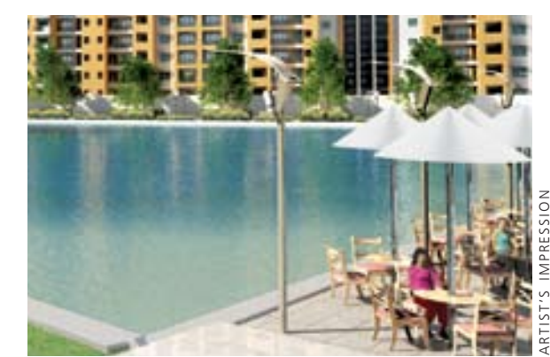
A VIEW OF THE PROPOSED LAKESIDE CAFÉS