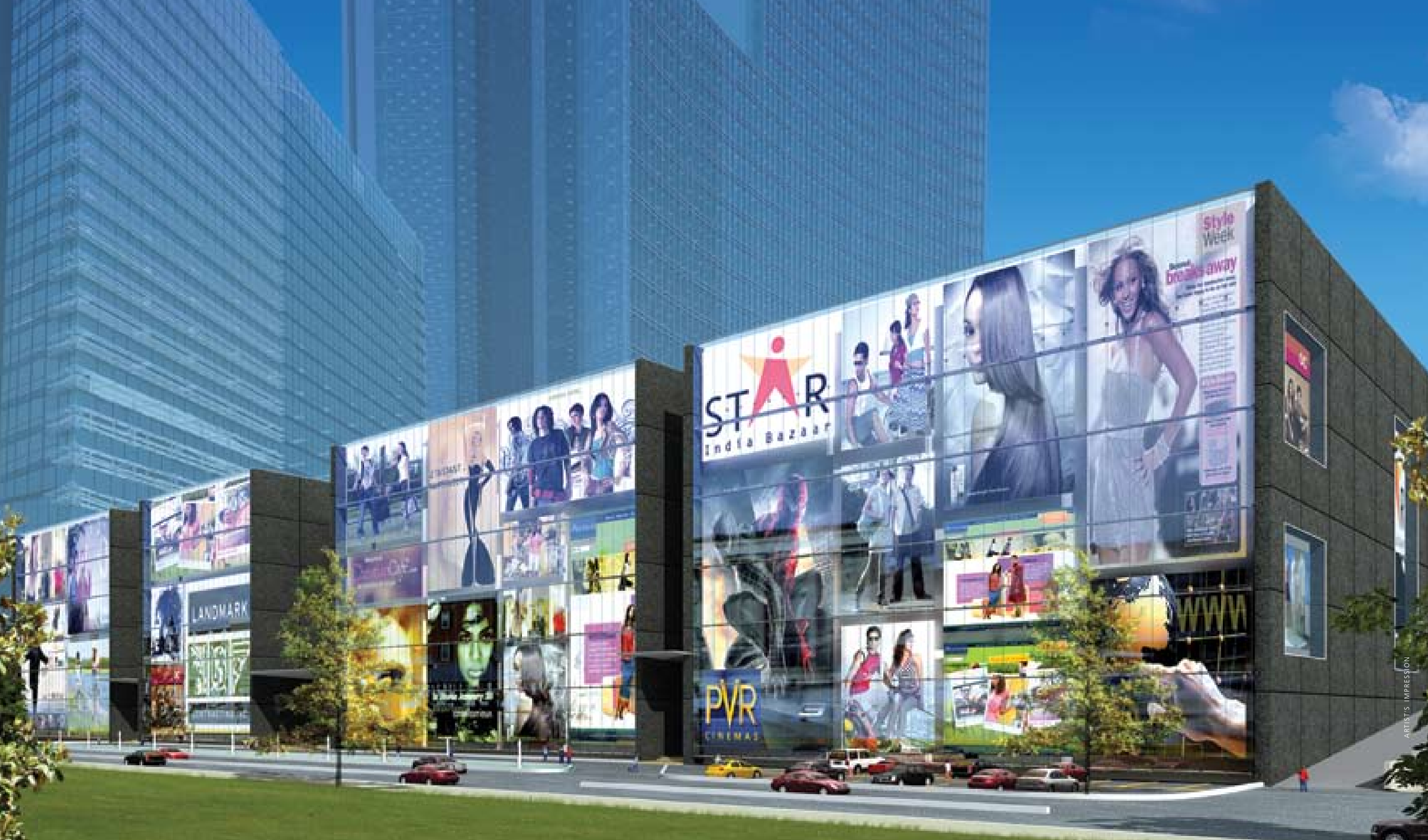
A WORLD-CLASS SETTING: ORION MALL WITH SHERATON BANGALORE @ BRIGADE GATEWAY AND NORTH STAR (30-STORY OFFICE TOWER) IN THE BACKGROUND