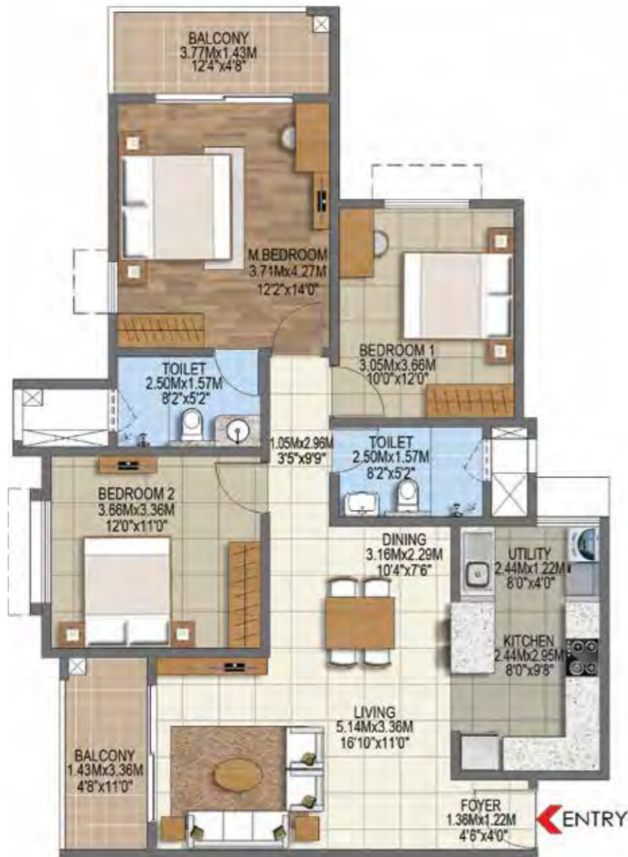
CLUSTER PLAN (BLOCK-B)

TYPE H1 3 BEDROOMS + 2 TOILETS + 2 BALCONY (13 th floor and above)